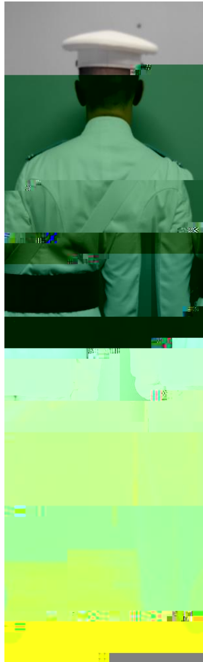
Dress Whites Under Arms, Sword